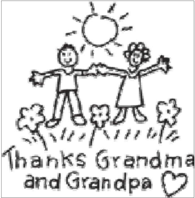
Grandparents Day—September 9