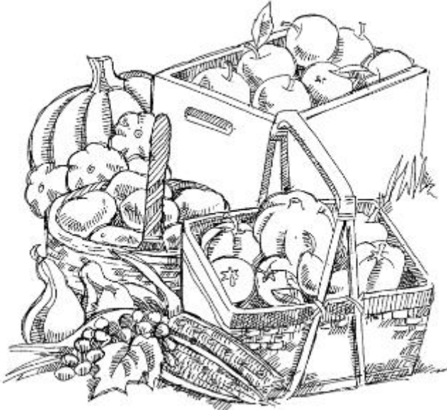
First Day of Autumn—September 22